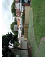
Basketball court retained and refurbished