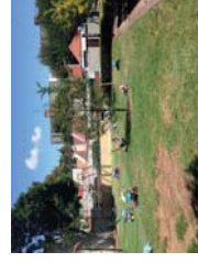
Improvement of lawn area