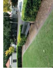
Opportunity to improve seating area