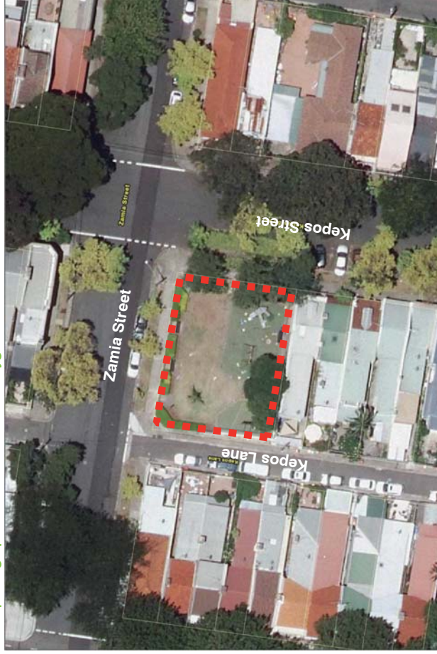
Aerial photograph • Elizabeth McCrae Playground

We invite you to comment on the proposal for Elizabeth McCrae Playground.